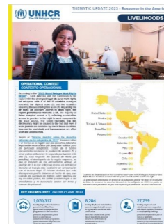
REGIONAL: Livelihoods thematic update- August 2023

Thanks to all our donors in 2023 (as of 4 October):