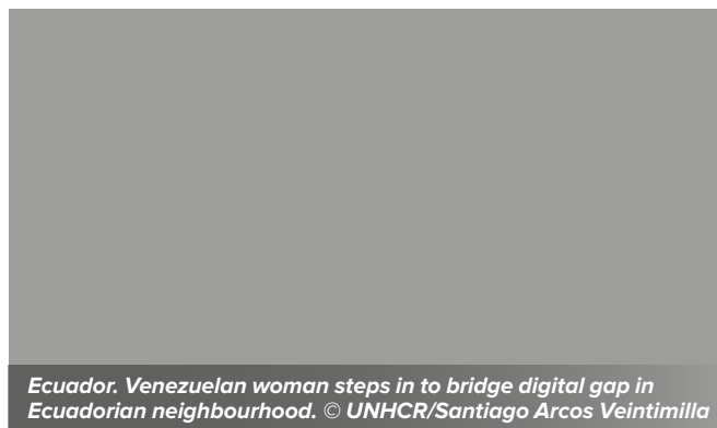
Ecuador. Venezuelan woman steps in to bridge digital gap in Ecuadorian neighbourhood.

Given the urgent need to redouble efforts to address the crisis of human mobility and displacement in the region and look for solutions, while addressing the needs of women and girls and mitigating the risks they face, UNHCR and UN Women signed a joint work plan that will run until the end of 2024.