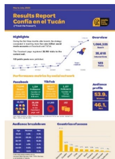
MCO PANAMA: Trust the Toucan Results Report